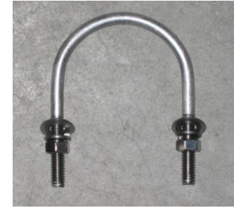
U-Bolt - Washer - Lock Washer - Bolt